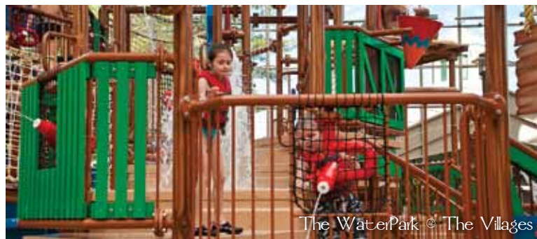
The WaterPark © The Villages

At what time do twilight rates start at The WaterPark @ The Villages?