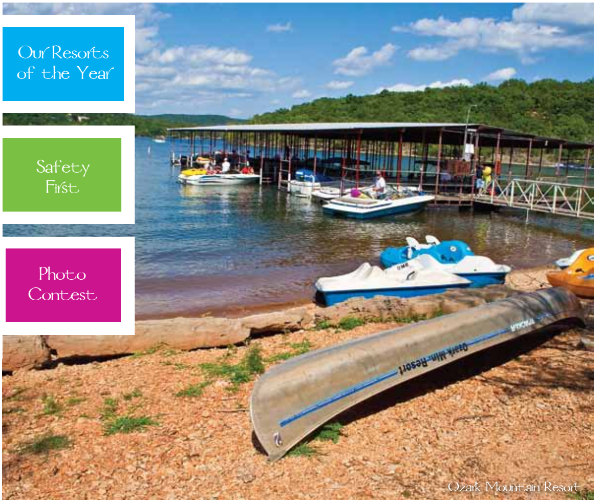
Ozark Mountain Resort