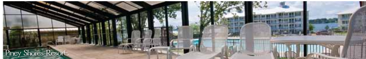
Piney Shores Resort