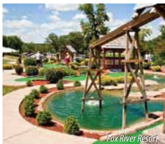
Fox River Resort

“4444” from your unit and your call will be answered by our on-site Silverleaf Service Manager who will be able respond to those issues and ensure your needs are handled in a professional and timely manner.