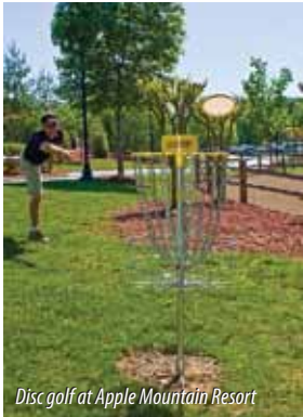
Disc golf at Apple Mountain Resort

DISC GOLF has been added to the amenities offered at Lake O'The Woods. Also offered at Apple Mountain Resort, disc golf is a great activity for the whole family. Check out a set of discs at the Activity Center and try your hand at Lake O'The Woods' newest activity.