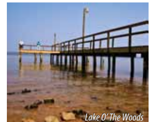
Lake O' The Woods

“4444” from your unit and your call will be answered by our on-site Silverleaf Service Manager who will be able respond to those issues and ensure your needs are handled in a professional and timely manner.