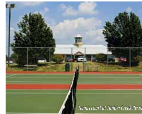
Tennis court at Timber Creek Resort

Both at Fox River and Apple Mountain resorts, there is a lot going on at and around the resorts. In addition to all the organized events, these areas abound with weekend activities, celebrations, fireworks, music and much more. Check with your Silverleaf Service Manager - just dial "4444" - or visit the Front Desk for a complete listing of summer events.