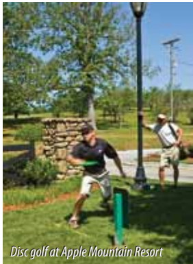
Disc golf at Apple Mountain Resort