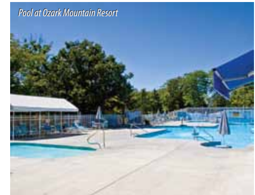
Pool at Ozark Mountain Resort

Fireworks will start at approximately 9:30 p.m. on July 4 in Kimberling City, and Ozark Mountain Resort will have a great party by the pool with lots of food and games and a DJ. A second airport has opened in Branson with Sun Country Airlines and AirTran both flying into this new airport. For more information on flights and fares visit www.flybranson.com . In the Branson area, if you're at Holiday Hills Resort, Silver Dollar City is hosting National Kids' Fest from June 6 - August 9 and the Demolition Derby is coming to Shadow Rock Park on August 22.