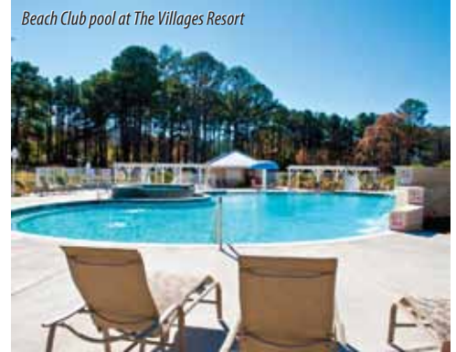
Beach Club pool at The Villages Resort

August are "Back to School Weekends" at Lake O'The Woods, with games, cookie eating contests and great prizes. Special Labor Day activities include a hot dog eating contest, water balloon toss and more for the whole family. Weekends at Holly Lake are jam-packed with activities, contests,