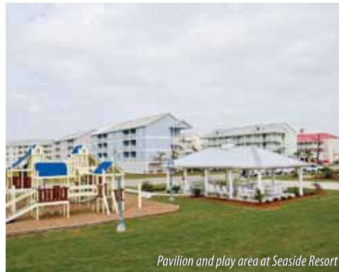
Pavilion and play area at Seaside Resort

crafts and so much more. From early June all the way through Labor Day, there is non-stop fun if you're at Holly Lake. For the dads and sons who love to fish, come on out on June 27th for a Father and Son Fishing Contest and whomever catches the largest fish takes home a prize! Both Seaside and Piney Shores Resorts have summer activities planned for children of all ages. Travel through time at Hill Country this summer –