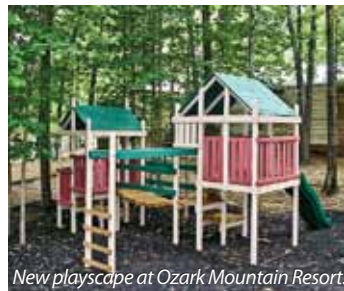
New playscape at Ozark Mountain Resort.

We have a designated Silverleaf Service Manager at each resort who is available to answer any and all of your questions. All you need to remember is "4444" for answers to your vacation needs! If you need additional towels or other unit items or just want to go somewhere special for dinner, just dial "4444" from your unit and your call will be answered by an on-site Silverleaf Service Manager who will be able to respond to those issues and ensure your needs are handled in a professional and timely manner. ❁