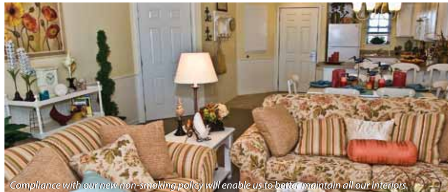
Compliance with our new non-smoking policy will enable us to better maintain all our interiors.

We value the time you spend at our resorts. We know our improvements will help provide a cleaner environment and create a more enjoyable vacation experience for everyone. ❁