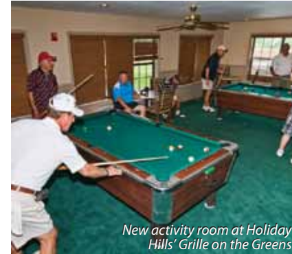
New activity room at Holiday Hills' Grille on the Greens

handrails. Hill Country Resort and Piney Shores Resort both have new pool furniture. The condo cabins at Piney Shores are also receiving interior refurbishments that includes sofas, lounge chairs, mattresses and bedding. A new and improved game and equipment check-out area has also been completed at the Activity Center.