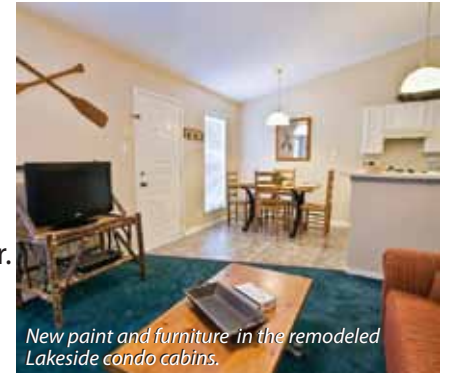
New paint and furniture in the remodeled Lakeside condo cabins.

Members and their guests visiting Holiday Hills Resort will find new commercial-grade fitness equipment and a tanning bed can be found at the fitness center in the Activity Center. A new activity room at the Grille on the Greens and two new golf course restrooms are now open. Ozark Mountain Resort has a new playscape and swings at the Activity Center. Timber Creek Resort has a new indoor movie theater at the Activity Center and a new sand volleyball court.