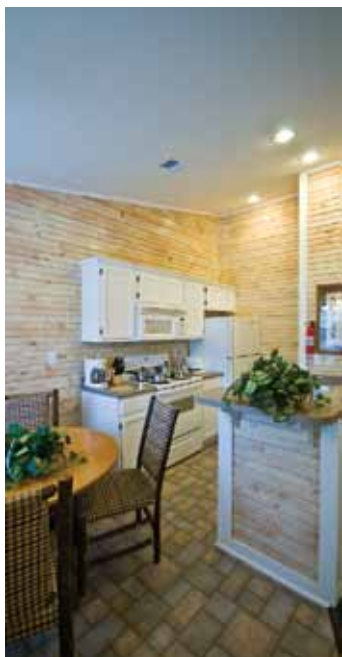
Newly renovated kitchen/dining area (above) and living room (below) in the condo cabins at Piney Shores that have a new whitewashed/glazed interior.

*Certain restrictions may apply. Our Platinum Referral Program representatives will inform you of any applicable state and program regulations. We reserve the right to substitute premiums of comparable value without notice, unless prohibited by law.