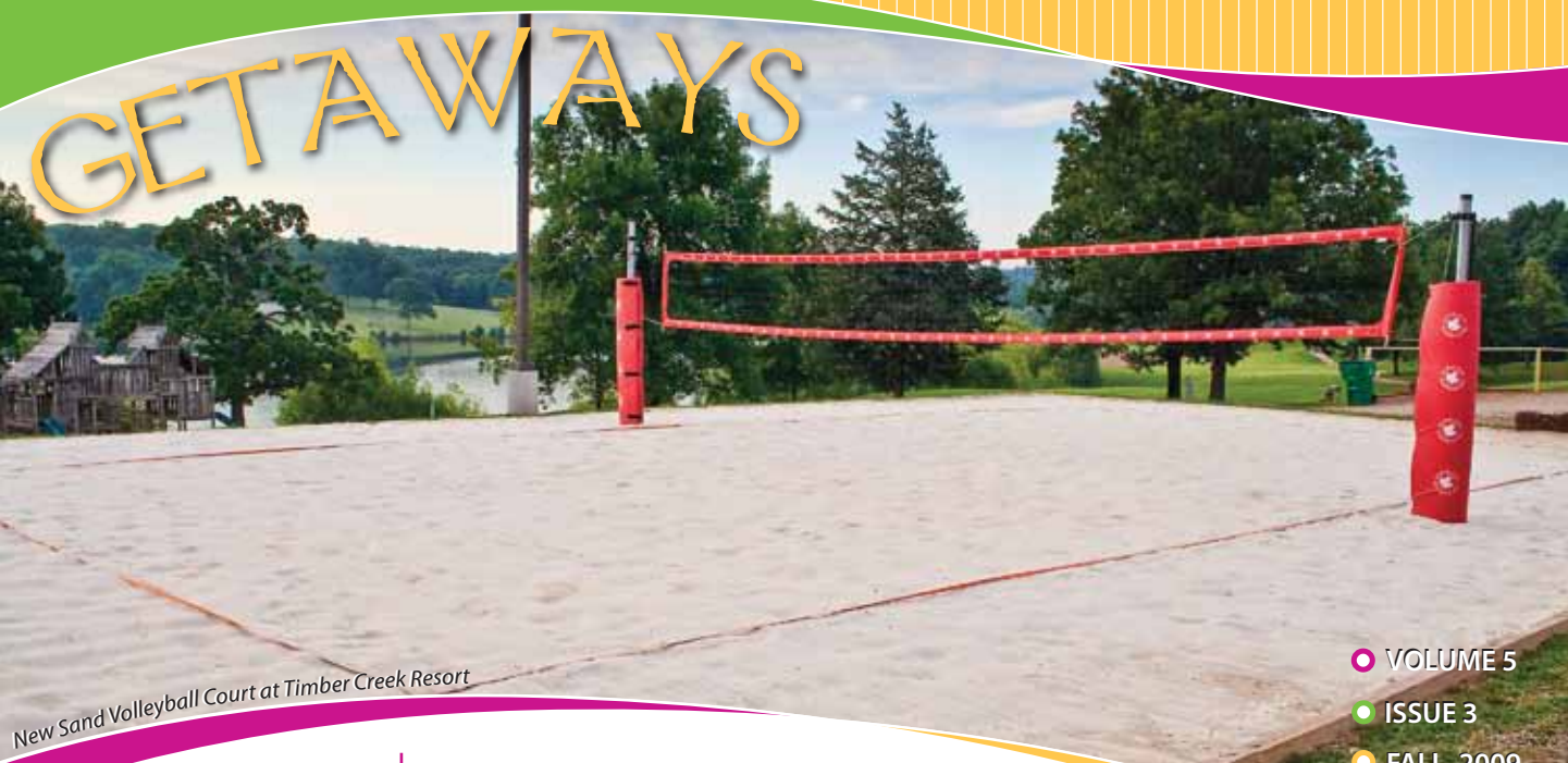
New Sand Volleyball Court at Timber Creek Resort