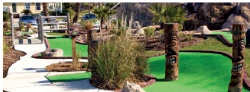
The new miniature golf course at Silverleaf's Seaside Resort.

In our last newsletter we announced the addition of wi-fi capability at some of our resorts. Since then we have added resorts to the wi-fi available list. Here is an update on our resort-wide progress.